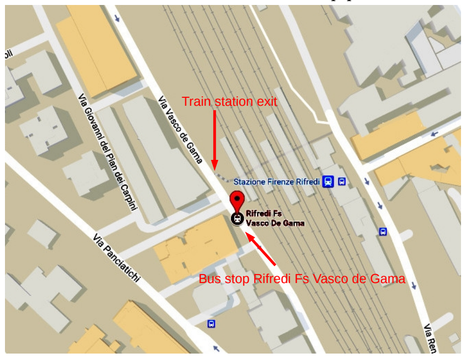
Rifredi Fs Vasco De Gama bus stop position